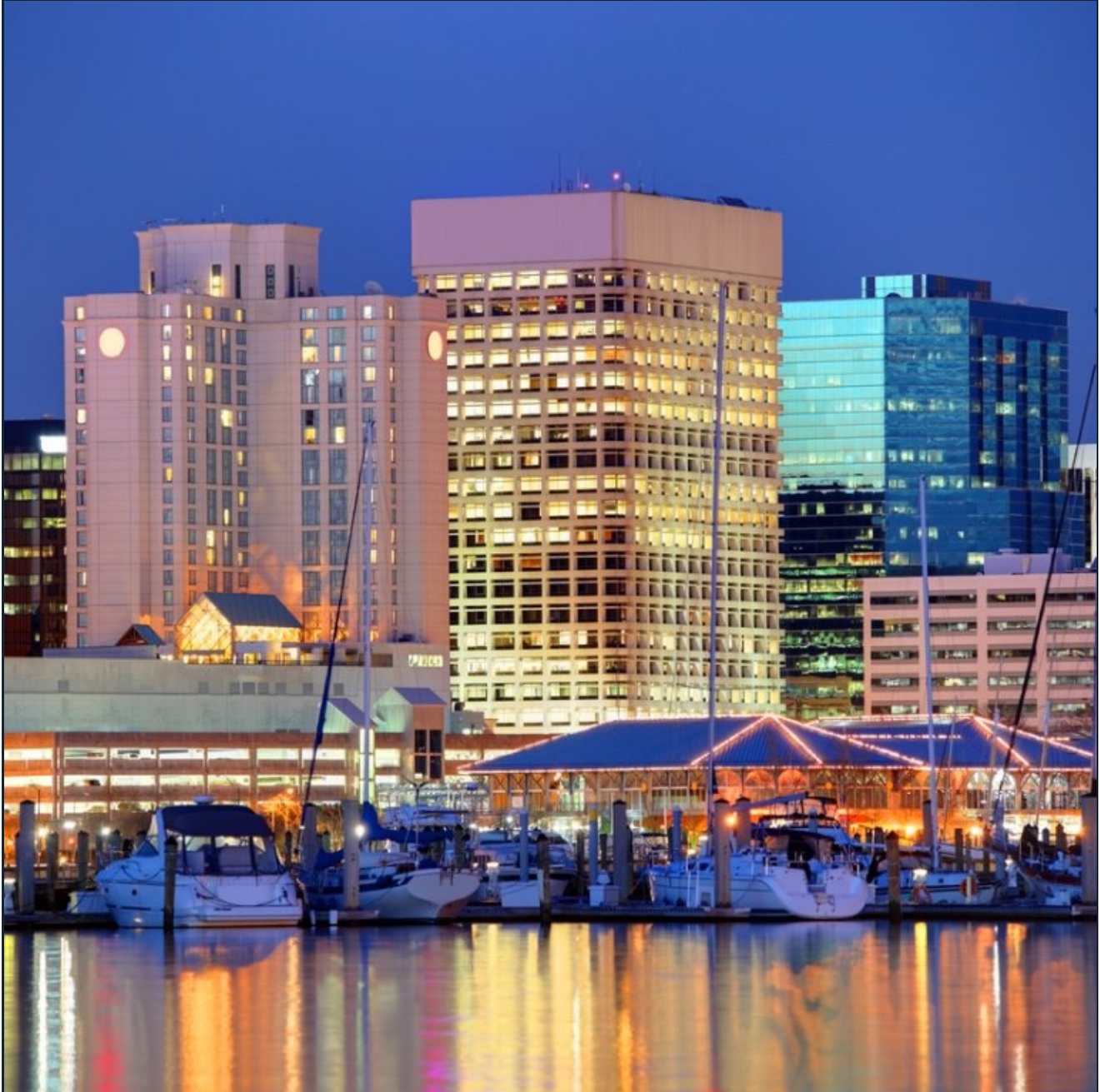
EXHIBIT & SPONSOR PROSPECTUS

April 7 - 10, 2019 Hilton Norfolk, The Main